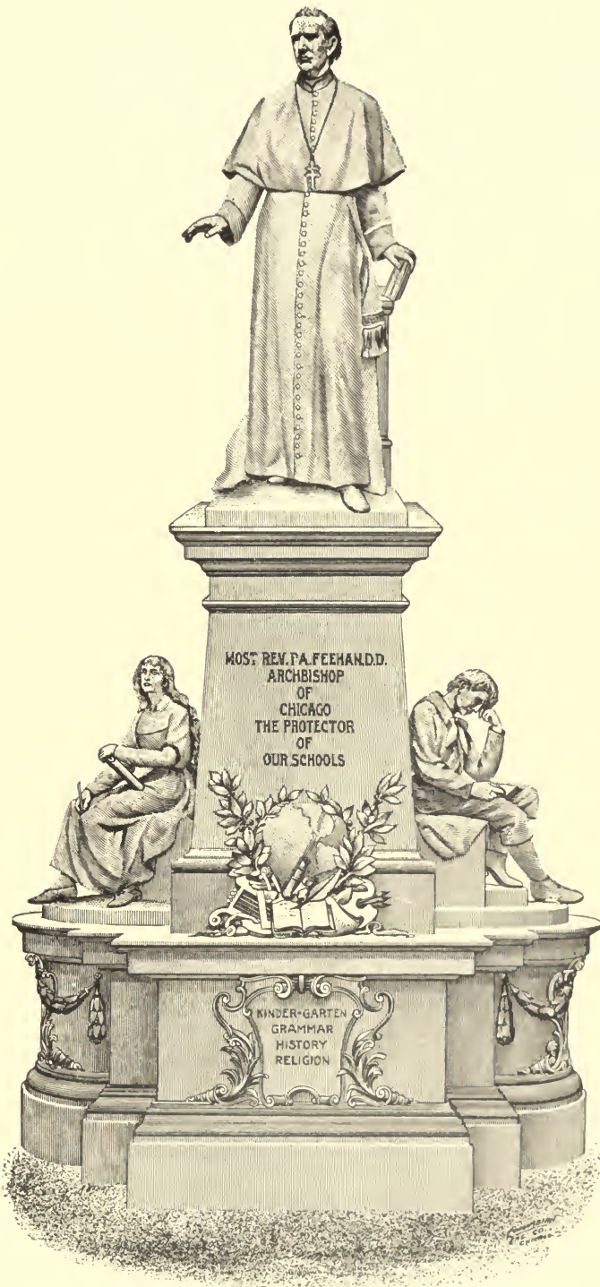
STATUE OF ARCHBISHOP FEEHAN IN CARRARA MARBLE, GIFT OF THE CLERGY OF CHICAGO. ON EXHIBITION AT CATHOLIC EDUCATION EXHIBIT AT WORLD'S FAIR.